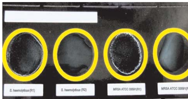
Figure 1. Positive latex agglutination reaction of one Staphylococcus haemolyticus strain (R1) and negative control of the same strain; quality control-positive latex agglutination reaction of MRSA ATCC 33591 and negative control of the same strain

Of the 14 analyzed strains of staphylococci, 11 were identified as S. haemolyticus and the remaining 3 strains were identified as S. capitis , S. epidermidis and S. vitulinus . All investigated strains were classified as resistant to oxacillin and/or ceftiofur by disc diffusion method. For all isolates of S. haemolyticus oxacillin MIC values were in the range from 2 µg/mL to ≥64 µg/mL and ceftiofur MIC values were in the range from 4 µg/mL to >256 µg/mL. For S. capitis MIC values for both antibiotics were 32 µg/mL. For S. vitulinus oxacillin MIC value was 0.5 µg/mL and ceftiofur MIC value was 1 µg/mL. For S. epidermidis